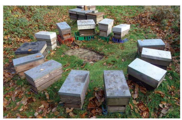
Mating nucleus hives, arranged in a circle in the apiary. The parent colony was initially located in the centre of the circle.

allowing the queens to emerge in larger colonies. Two frames of emerging brood and one frame of food, with all attached bees will make quite suitable mating colonies. The queens, mated from these larger nucleus hives, can take a little longer to mate and longer to start laying, but invariably such queens will turn out to be much better mated and longer lived.