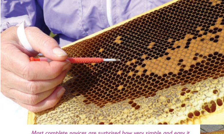
Most complete novices are surprised how very simple and easy it is to learn the technique of grafting. Here, novices are shown using a Chinese grafting tool.

Bees which naturally supersede are desirable. This is not under our control although we can simulate supersedure artificially. The queen should be at least one year old, since a younger queen, particularly a current season's queen, produces too much of the queen substance pheromones for this method to succeed reliably. If we exclude the queen from a part of the hive where there is young brood, the bees will often feel as though the queen is failing and they may (usually, but not always) be willing to build queen cells. Such conditions are easily produced in the upper brood box of a Demareed colony, which is the original vertically split colony concept for swarm control. If bees are not willing to start queen cells, we can achieve their co-operation by temporary confinement. Placing a temporary barrier under the upper brood chamber of the Demareed colony, such as a travelling screen or Snelgrove board or Cloake board, will persuade bees to