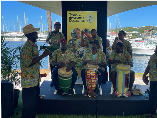
Figure 3: Solo Band "Campeche".

The opening ceremony was sounded off with vibrant melodies of creole voices and African drums of the authentic Saint Lucia genre of "Solo Music" from the group "Campeche". Visitors, dignitaries, and locals alike bobbed their heads to exotic mystical rhythms. Master of ceremonies quickly settled the audience and the programme swung into gear.